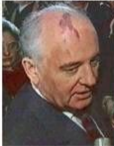
Roths child Rockefeller Wealthy & powerful friends.

5 months and 2 days later: Mikhail Gorbachev on April "11"th, 1990 announces "We are only beginning to shape the New World Order."