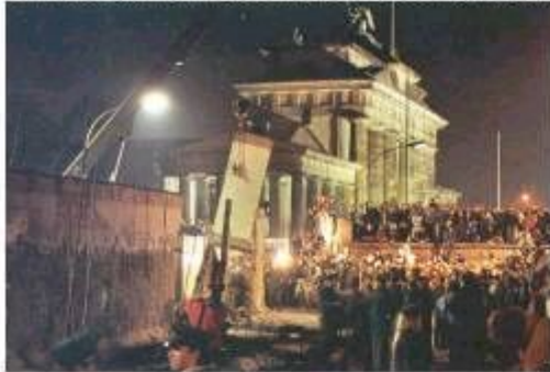
Berlin Wall falling on "11-9"-1989 6:30pm Elite families: Duponts, Freemans, Reynolds, Onassis, Merovingians, Bundys, Warburgs, Russells, Mellons, Carnegies, Dukes, Astors, Paynes, Bakers, Tukes, Cullmans, Winthops, Milners... Exactly "11" years later to the hour:

Numerology is important to the conspirators... (3,6,7,"11",13,19,39,93,666) Faith in the Father and Son gives hope to the believers.