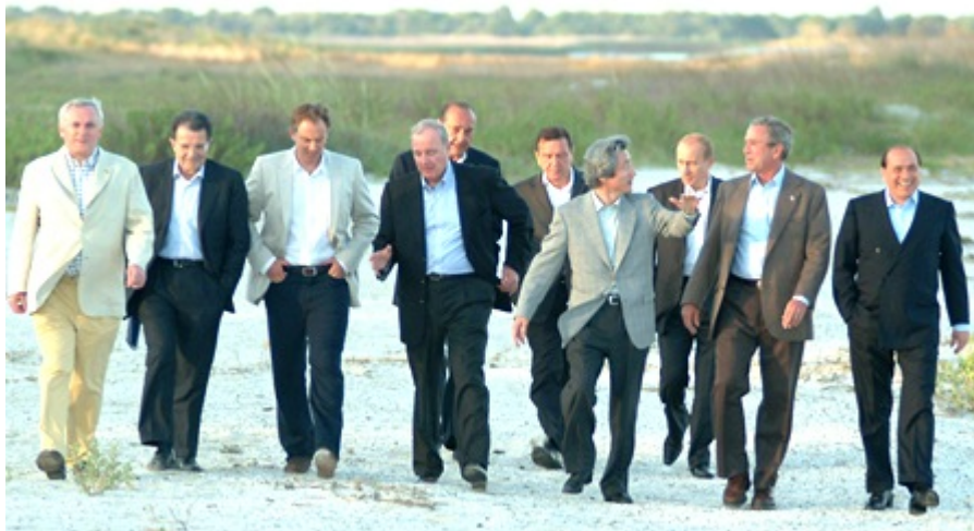
The Devil's Pimps and Propaganda Pumps