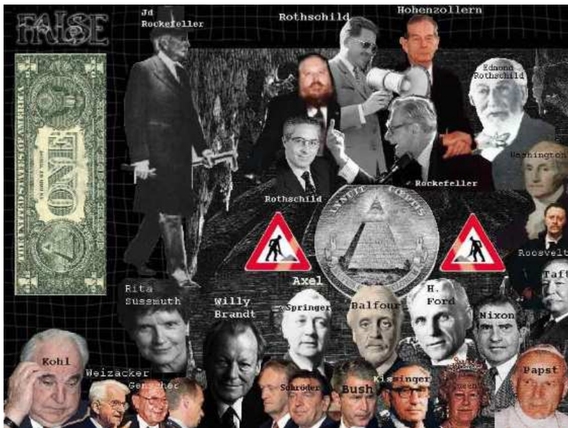
The Illuminati World Banking Organization - A Recent Generation