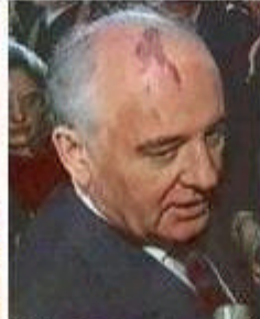
Roths child Rockefeller Wealthy & powerful friends.

5 months and 2 days later: Mikhail Gorbachev on April "11"th, 1990 announces "We are only beginning to shape the New World Order."