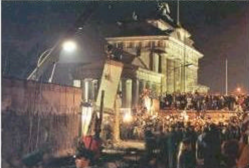
Berlin Wall falling on "11-9"-1989 6:30pm Elite families: Duponts, Freemans, Reynolds, Onassis, Merovingians, Bundys, Warburgs, Russells, Mellons, Carnegies, Dukes, Astors, Paynes, Bakers, Tukes, Cullmans, Winthops, Milners... Exactly "11" years later to the hour:

Numerology is important to the conspirators... (3,6,7,"11",13,19,39,93,666) Faith in the Father and Son gives hope to the believers.