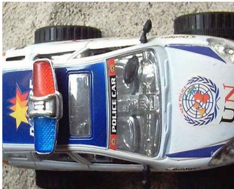
New UN Global Government “Super Police” toys for the children.

It is already occurring and more... (see the actual toy spoken of in the following photograph.)