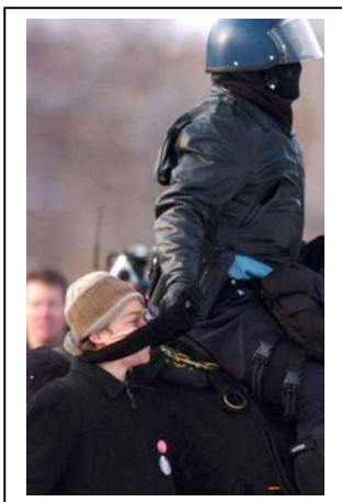
Toledo Cops tazer protesters, make pre-emptive arrests, and nab activists during the demo while the "Peace Team" lies down in front of horses.

On December 10, 2005 the Nazis and White Power freaks from the National Socialist Movement (NSM) invaded Toledo, OH for the second time in three months.